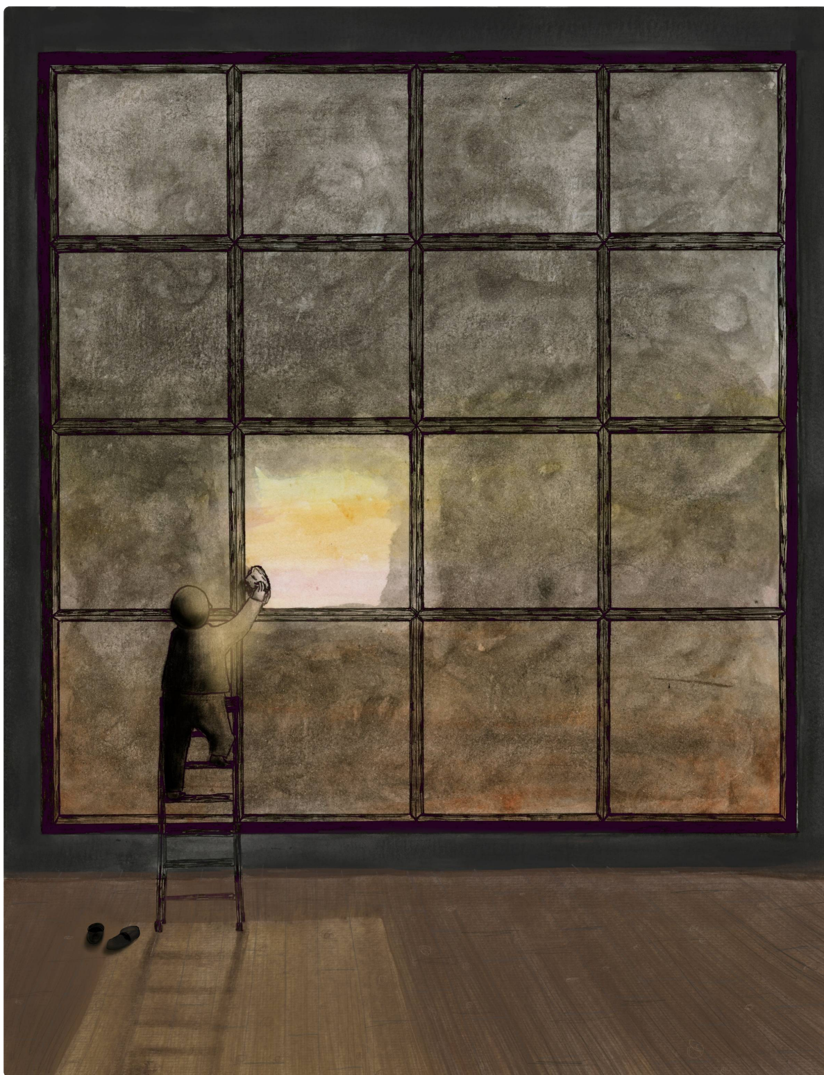
Watercolor and ink on paper

This drawing originally was a practice editorial illustration for an article about animatics. I'm still pretty proud of it, especially because it can mean so many things beyond its initial intention.